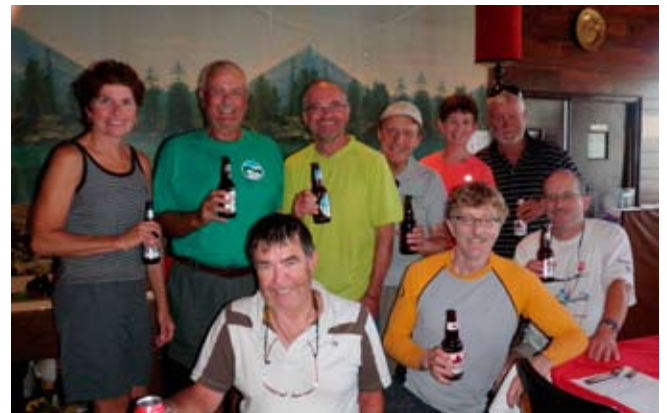
The French River gang